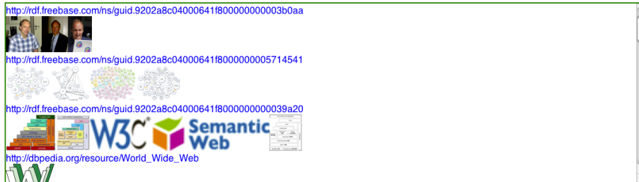
Fig. 2. Graphical symbolizations of several entities (TimBL, Semantic Web, etc.)

In a final step the detected entities are merged, and a symbolization for each entity gets retrieved by means of a heuristic approach, including Google image search.