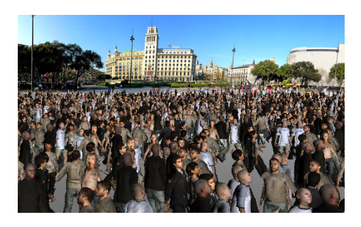
Figure 1: Crowd rendered with per-joint relief impostors.

imation frame an image has to be stored). Using separate impostors for different body parts provides a more memoryefficient approach. We also benefit from the use of LOD by simplifying the input bone hierarchy grouping joints (letting some parent nodes absorb small child nodes). We created bone hierarchies with 21, 7, and 1 joint (no animation).