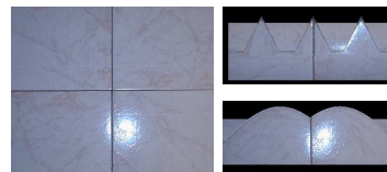
Fig. 5. Different operators applied on the same image.

In this paper we have presented a system based on a point representation that is able to create very interesting effects in little time. Figure 5-right shows two examples where the main region consisted on isolated points and a linear (top) and a cosine-based (bottom) operators were applied. These manipulations only needed 90 seconds of user intervention.