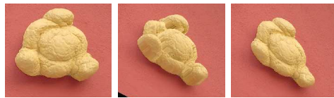
Fig. 1. The famous Dalí bread on the wall of the museum (left and right) and a 3D modification of it (center).

The complexity of virtual environments has grown spectacularly over the recent years, mainly thanks to the, now affordable, high performance graphics cards. These highly complex models are made of objects that usually cover only a few, or even fractions of, pixels on the screen. Polygon-based systems are advan-