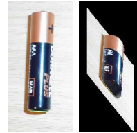
Fig. 4. Cape operator.

The cosine-based operators allow to create rounded shapes. These operators allow to modify a region with a curve that is a function of the cosine of the distance, so the points in the secondary regions will have a new Z value following the formula Z = \max(0, Z_{inc} - \cos(m \cdot dist)) where m has values from 1 to 5 and from 0.5 to 0.9 (with increments of 0.1). We also offer the functions Z = \max(0, Z_{inc} - (1/2) \cos \cdot dist) and Z = \max(0, Z_{inc} - (1/3) \cos \cdot dist) . To help the user