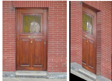
Fig. 3. Stair operator.

The stair operator performs a constant change on the Z axis. When applied to any region, each point is assigned the Z value determined by the user. In Figure 3 we can see an example of this tool. The image on the left shows the entrance of a house, and on the right we have pulled the wall all around. Note that the stair function has generated a realistic 3D geometry. Only at the left part of the door the colours of the bricks were not copied when filling holes because the region selection at this point overlapped a little part of the wooden material. The flatten operator restores the points of the selected region to Z = 0 and eliminates the extra points that were added for hole filling during the geometry update.