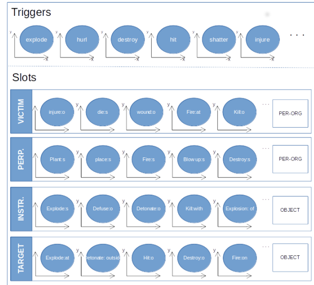
Figure 1: Event Schema Definition

In contrast with information extraction systems that are based on atomic relations, event schemas allow for a richer representation of the semantics of a particular domain. But, while there has been a significant amount of work in relation discovery, the task of unsupervised event schema induction