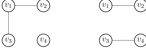
Figure 2: Two chromatically equivalent graphs, X_1 (left) and X_2 (right).

The base cases of the addition-contraction recursion are of the form \chi(K_n, x) = x(x - 1) \cdots (x - n + 1) . Thus, to obtain \chi(G, x) for a graph G that is not a clique and has n vertices, we can use this recursion to expand \chi(G, x) until every term in the expansion is of the form \chi(K_m, x) with m \leq n .